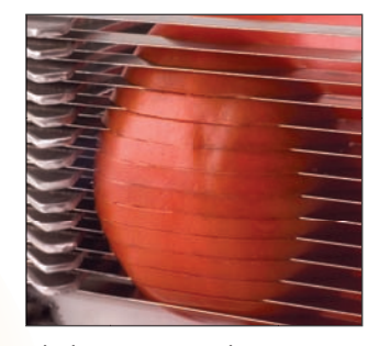
Blades are razor-sharp stainless steel for a smooth, precise cut.