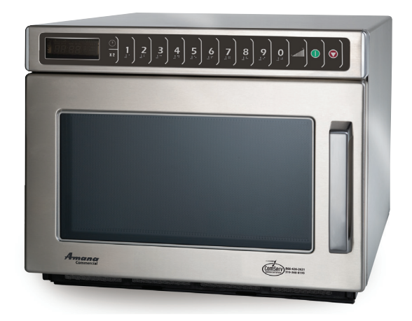
Model HDC182 shown