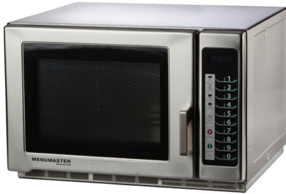
Model MFS12TS shown