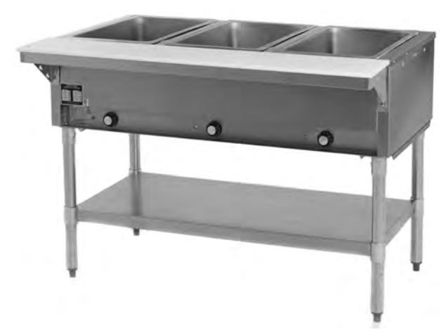
#DHT3-120 hot food table

Eagle Hot Food Tables, open base design, model ______. Top and body to be heavy gauge type 430 stainless steel. Beaded top openings to be 12½ x 20½ x 20½ x 20½ x 20½ feating compartments to be 8″-deep, galvanized, and insulated on all four sides and bottom with 1″ fiberglass or equal. Recessed control panel, with individual infinite controls, offer high and low settings. Each compartment fitted with 500-watt heating element for 120-volt units, and 750-watt heating element for 240-volt units. Six foot cord and plug extends from the bottom right hand side of the unit. Furnish with polycarbonate cutting board. Legs to be 1½ 0.D. tubing, with adjustable undershelf and adjustable bullet feet.