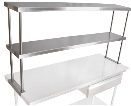
OS-ED-1248 (Does Not Include Table)

DOUBLE OVER SHELF WITH ADJUSTABLE MID SHELF