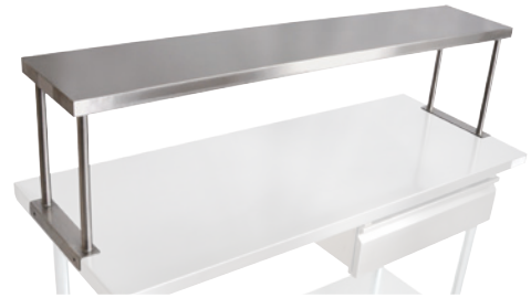
OS-ES-1248 (Does Not Include Table)