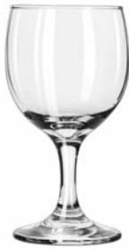
Wine No. 3764 ■ 8½ oz./25.1 cl./251 ml. H5½ T2½ B2¾ D3½ 2 doz./10# • .98 cu.ft. SCC 370082 TRAEX TR-12HH □