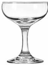
Champagne No. 3777 ■ 4½ oz./13.3 cl./133 ml. H4¼ T3¼ B2¾ D3¾ 3 doz./14# • 1.31 cu.ft. SCC 239849 TRAEX TR-6B □