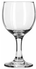
Wine No. 3769 ■ 6½ oz./19.2 cl./192 ml. H5¾ T2½ B2½ D2¾ 2 doz./11# • .79 cu.ft. SCC 370105 TRAEX TR-7CC □