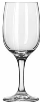
Wine No. 3783 ■ 8¾ oz./25.9 cl./259 ml. H7 T2¼ B2¾ D2¾ 2 doz./11# • .96 cu.ft. SCC 373915 TRAEX TR-7CCC □