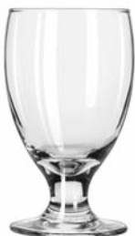
Banquet Goblet No. 3712 ■ No. 3752HT ★ ■ 10½ oz./31.1 cl./311 ml. H5¼ T2¾ B2¾ D3½ 2 doz./14# • .93 cu.ft. No. 3712-SCC 369994 No. 3752HT-SCC 370068 TRAEX TR-6BB □