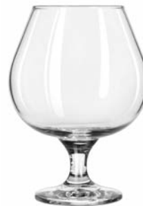
Brandy No. 3709 ■ 22 oz./65.1 cl./651 ml. H6 T2 3/4 B2 7/8 D4 3/8 1 doz./8# = .97 cu.ft. SCC 294602 TRAEX TR-8DD □