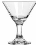
Mini-Martini No. 3701 ■ 3 oz./8.9 cl./89 ml. H3¾ T3½ B2½ D3½ 1 doz./4# • .37 cu.ft. SCC 351548 TRAEX TR-12H □