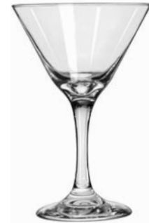
Martini No. 3779 ■ 9¼ oz./27.4 cl./274 ml. H6½ T4¾ B3 D4¾ 1 doz./8# • 1.13 cu.ft. SCC 019578 TRAEX TR-8DDD □