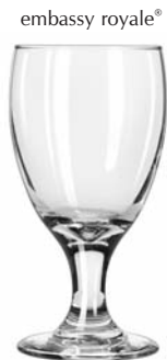
Banquet Goblet No. 3721 ■ 10½ oz./31.1 cl./311 ml. H6 T3 B2¾ D3¼ 3 doz./22# • 1.57 cu.ft. SCC 556755 TRAEX TR-12HH □