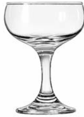
Champagne No. 3773 ■ 5½ oz./16.3 cl./163 ml. H4½ T3¼ B2¾ D3¾ 3 doz./15# • 1.38 cu.ft. SCC 239832 TRAEX TR-6B □