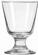
Footed Rocks No. 3747 ■ 7 oz./20.7 cl./207 ml. H4 3/8 T3 1/4 B2 3/4 D3 1/4 2 doz./13# = .81 cu.ft. SCC 370051 TRAEX TR-12H □