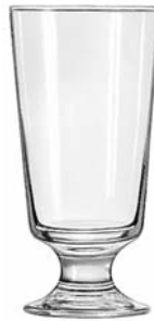
Footed Hi-Ball No. 3737 ■ 10 oz./29.6 cl./296 ml. H6 T2 3/8 B2 3/4 D2 7/8 2 doz./14# = .89 cu.ft. SCC 370037 TRAEX TR-7CC □