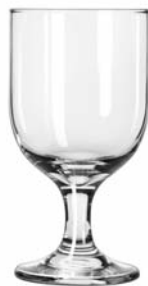
Goblet No. 3756 ■ 10¼ oz./30.3 cl./303 ml. H5¾ T3 B2¾ D3 2 doz./12# • .94 cu.ft. SCC 370075 TRAEX TR-12HH □