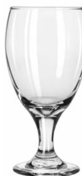
Iced Tea No. 3716 ■ 16¼ oz./48.1 cl./481 ml. H7 T3¼ B3 D3½ 3 doz./28# • 2.31 cu.ft. SCC 516766 TRAEX TR-6BBB □