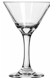
Cocktail No. 3733 ■ 7½ oz./22.2 cl./222 ml. H6½ T4¼ B3 D4¼ 1 doz./7# • .99 cu.ft. SCC 317575 TRAEX TR-8DDD □