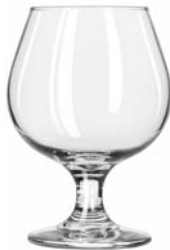
Brandy No. 3705 ■ 11 1/2 oz./34.0 cl./340 ml. H5 T2 1/4 B2 3/4 D3 5/8 2 doz./11# = 1.13 cu.ft. SCC 294596 TRAEX TR-6BB □