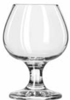
Brandy No. 3702 ■ 5 1/2 oz./16.3 cl./163 ml. H4 1/8 T2 B2 3/8 D2 7/8 1 doz./4# = .33 cu.ft. SCC 574582 TRAEX TR-7C □