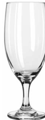
Tall Iced Tea No. 3750 ■ 16 oz./47.3 cl./473 ml. H8¾ T2¾ B3 D3 3 doz./24# • 2.18 cu.ft. SCC 858934 TRAEX TR-6BBB □