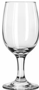
Wine No. 3765 ■ 8½ oz./25.1 cl./251 ml. H6¾ T2¾ B2¼ D2¾ 2 doz./11# • .87 cu.ft. SCC 370099 TRAEX TR-7CC □