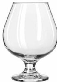
Brandy No. 3708 ■ 17 1/2 oz./51.8 cl./518 ml. H5 1/2 T2 3/8 B2 3/4 D4 2 doz./14# = 1.53 cu.ft. SCC 573929 TRAEX TR-8DD □