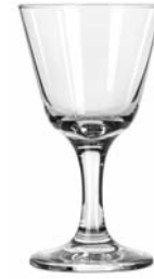
Cocktail No. 3770 ■ 4½ oz./13.3 cl./133 ml. H5½ T2½ B2½ D2½ 3 doz./13# • 1.17 cu.ft. SCC 239825 TRAEX TR-7CC □