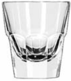
Rocks No. 15248 + 4½ oz./13.3 cl./133 ml. H3½ T3 B2½ D3 3 doz./21# • .71 cu.ft. SCC 109005 TRAEX TR-7 □