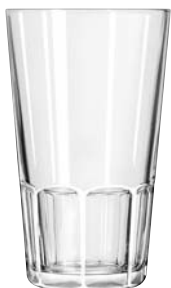
Mixing Glass No. 15230 + 16 oz./47.3 cl./473 ml. H5½ T3½ B2½ D3½ 2 doz./26# • 1.27 cu.ft. SCC 025791 TRAEX TR-6BB □