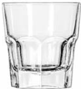
Tall Rocks No. 15231 + 9 oz./26.6 cl./266 ml. H3½ T3½ B2½ D3½ 3 doz./29# • 1.19 cu.ft. SCC 105366 TRAEX TR-6B □