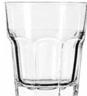
Double Rocks No. 15243 + 12 oz./35.5 cl./355 ml. H4 T3½ B2¾ D3¾ 3 doz./27# • 1.30 cu.ft. SCC 733200 TRAEX TR-11G □