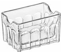
3½" Sugar Package Holder No. 5258 H2½ T3½ B3½ D3½ 2 doz./11# • 35 cu.ft. SCC 177363 TRAEX TR-7A □