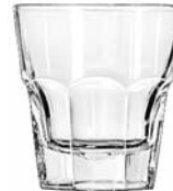
Rocks No. 15240 + 8 oz./23.7 cl./237 ml. H3½ T3½ B2½ D3½ 3 doz./27# • 1.07 cu.ft. SCC 007691 TRAEX TR-6B □