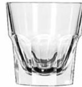
Tall Rocks No. 15245 + 7 oz./20.7 cl./207 ml. H3½ T3¼ B2½ D3¼ 3 doz./26# • .97 cu.ft. SCC 109012 TRAEX TR-6A □