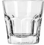
Rocks No. 15241 + 7 oz./20.7 cl./207 ml. H3¼ T3½ B2¼ D3½ 3 doz./18# • .85 cu.ft. SCC 733088 TRAEX TR-12A □