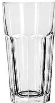
Iced Tea No. 15253 + 22 oz./65.1 cl./651 ml. H7 T3¾ B2¾ D3¾ 2 doz./38# • 1.72 cu.ft. SCC 867462 TRAEX TR-11GGG □