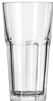
Cooler No. 15665 + 20 oz./59.2 cl./592 ml. H6¾ T3¾ B2¾ D3¾ 2 doz./29# • 1.57 cu.ft. SCC 063267 TRAEX TR-11GGG □