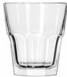
Rocks No. 15249 + 5½ oz./16.3 cl./163 ml. H3½ T3 B2½ D3 3 doz./16# • .73 cu.ft. SCC 108992 TRAEX TR-12 □