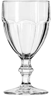
Wine No. 15246 + 8½ oz./251 cl./251 ml. H6¼ T3½ B3 D3½ 3 doz./30# • 1.65 cu.ft. SCC 790739 TRAEX TR-6BB □