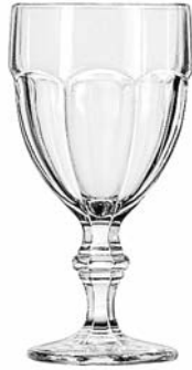
Goblet No. 15247 + 11½ oz./340 cl./340 ml. H6¾ T3¾ B3½ D3¾ 3 doz./35# • 2.11 cu.ft. SCC 790746 TRAEX TR-6BBB □