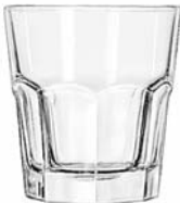
Rocks No. 15232 + 10 oz./29.6 cl./296 ml. H3½ T3½ B2½ D3½ 3 doz./27# • 1.19 cu.ft. SCC 105373 TRAEX TR-6B □