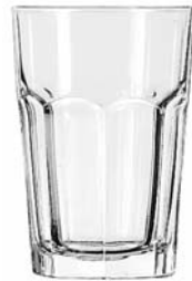
Beverage No. 15244 + 14 oz./41.4 cl./414 ml. H5½ T3½ B2¾ D3½ 3 doz./37# • 1.60 cu.ft. SCC 733224 TRAEX TR-6BB □