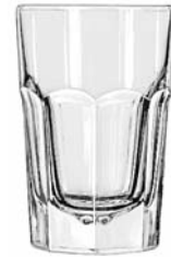
Hi-Ball No. 15236 + 9 oz./26.6 cl./266 ml. H4¼ T3½ B2½ D3½ 3 doz./33# • 1.18 cu.ft. SCC 057979 TRAEX TR-12HA □