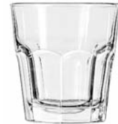
Rocks No. 15242 + 9 oz./26.6 cl./266 ml. H3½ T3½ B2½ D3½ 3 doz./22# • 1.07 cu.ft. SCC 733187 TRAEX TR-6A □