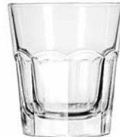
Double Rocks No. 15233 + 13 oz./38.5 cl./385 ml. H4½ T3¾ B2¾ D3¾ 3 doz./32# • 1.51 cu.ft. SCC 105380 TRAEX TR-11G □