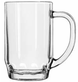
Thumbprint Stein No. 5303 19½ oz./57.7 cl./577 ml. H5½ T3¾ B2¾ D6¾ 2 doz./32# • 1.62 cu.ft. SCC 520275 TRAEX TR-4DD □