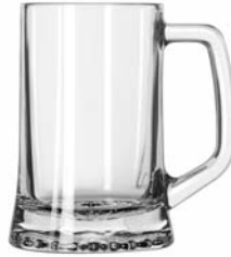
Maxim Mug No. 2130SA628 9¾ oz./28.5 cl./285 ml. H4¾ T2¾ B3¼ D4½ 1 doz./16# • .67 cu.ft. SCC 368157 TRAEX TR-4DD □