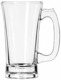
Mug No. 5202 10 oz./29.6 cl./296 ml. H5½ T3½ B2½ D5½ 2 doz./28# • 1.19 cu.ft. SCC 759583 TRAEX TR-11GA □