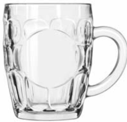
Sintra Mug No. 2187X1155 18½ oz./55.0 cl./550 ml. H4¾ T3¾ B2¾ D5¾ 1 doz./17# • .67 cu.ft. SCC 370877 TRAEX TR-18JA □