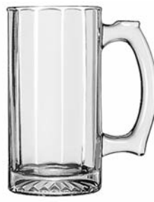
Sport Mug with Panels No. 52733 12 oz./35.5 cl./355 ml. H5½ T2¾ B2¾ D4¾ 1 doz./15# • .62 cu.ft. SCC 467235 TRAEX TR-5AA □