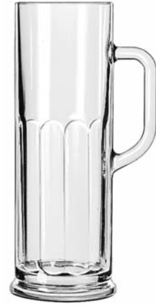
Frankfurt Mug No. 5001 21 oz./62.1 cl./621 ml. H9 T3 B3¾ D4¾ 1 doz./28# • 1.03 cu.ft. SCC 571949 TRAEX TR-4DDA □