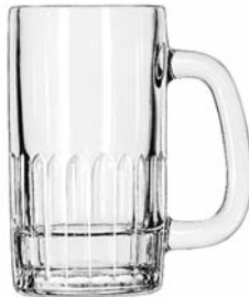
Mug No. 5309 12 oz./35.5 cl./355 ml. H5½ T3 B2½ D4¾ 2 doz./40# • 1.26 cu.ft. SCC 047826 TRAEX TR-5AA □