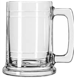
Maritime Mug No. 5027 15 oz./44.4 cl./444 ml. H5½ T3¼ B3¾ D5 1 doz./21# • .80 cu.ft. SCC 495993 TRAEX TR-4DA □