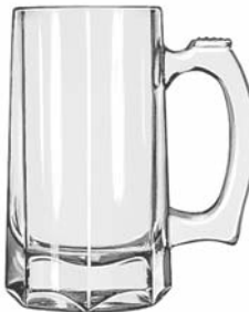
Stein No. 5206 12 oz./35.5 cl./355 ml. H5½ T2¾ B3¼ D4½ 1 doz./23# • .76 cu.ft. SCC 625185 TRAEX TR-4DD □