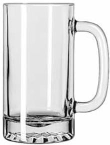
Tankard No. 5092 16 oz./47.3 cl./473 ml. H6½ T3¾ B3¾ D4¾ 1 doz./21# • .78 cu.ft. SCC 498475 TRAEX TR-4DD □