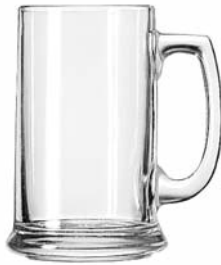
Handled Mug No. 5011 15 oz./44.4 cl./444 ml. H5½ T3 B3¾ D4½ 1 doz./17# • .73 cu.ft. SCC 492503 TRAEX TR-5AA □