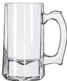
Stein No. 5205 10 oz./29.6 cl./296 ml. H5½ T2¾ B3¼ D4½ 1 doz./26# • .76 cu.ft. SCC 625178 TRAEX TR-4DD □