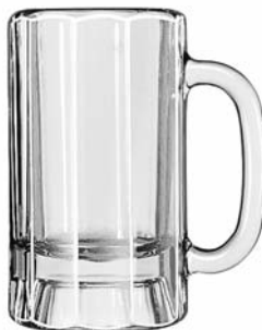
Paneled Mug No. 5018 14 oz./41.4 cl./414 ml. H6½ T3½ B3½ D5 1 doz./30# • .88 cu.ft. SCC 466863 TRAEX TR-4DD □