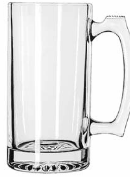
Sport Mug No. 5272 25 oz./73.9 cl./739 ml. H7½ T3¾ B3¾ D5½ 1 doz./34# • 1.13 cu.ft. SCC 863884 TRAEX TR-10FFA □