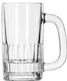
Mug No. 5307 8½ oz./25.1 cl./251 ml. H5¾ T2½ B2¾ D4¾ 2 doz./36# • 1.05 cu.ft. SCC 039869 TRAEX TR-5AA □