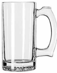
Mug No. 5273 12 oz./35.5 cl./355 ml. H5½ T2¾ B2¾ D4¾ 1 doz./16# • .62 cu.ft. SCC 135738 TRAEX TR-4DD □