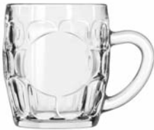
Sintra Mug No. 2187X1129 9¾ oz./29.2 cl./292 ml. H3¾ T3½ B2¾ D4½ 1 doz./12# • .39 cu.ft. SCC 370884 TRAEX TR-5A □