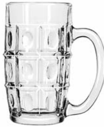
Vienna Stein No. 5305 11½ oz./34.0 cl./340 ml. H5¼ T2½ B2¾ D4½ 2 doz./22# • 1.20 cu.ft. SCC 508358 TRAEX TR-16BA □