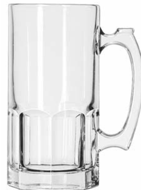
Super Mug No. 5262 34 oz./99.8 cl./998 ml. H8 T4 B4 D6 1 doz./39# • 1.50 cu.ft. SCC 001392 TRAEX TR-10FFA □