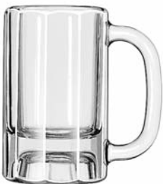
Paneled Mug No. 5019 10 oz./29.6 cl./296 ml. H5½ T3¼ B3¼ D4¾ 1 doz./25# • .58 cu.ft. SCC 894352 TRAEX TR-4DA □