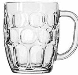
Dimple Stein No. 5355 19¼ oz./56.9 cl./569 ml. H4¾ T3¾ B2¾ D5¾ 2 doz./33# • 1.64 cu.ft. SCC 508365 TRAEX TR-10FA □