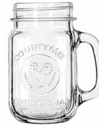
Drinking Jar No. 97085 16½ oz./48.8 cl./488 ml. H5¼ T2¾ B2½ D4½ 1 doz./12# • .62 cu.ft. SCC 866288 TRAEX TR-5AA □