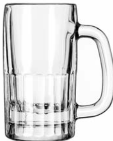
Mug No. 5362 10 oz./29.6 cl./296 ml. H5¾ T3½ B3 D4¾ 1 doz./23# • .66 cu.ft. SCC 063311 TRAEX TR-5AA □