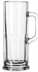
Frankfurt Sampler No. 5003 4 oz./11.8 cl./118 ml. H5 T1½ B2 D2½ 2 doz./12# • .47 cu.ft. SCC 623775 TRAEX TR-9EE □