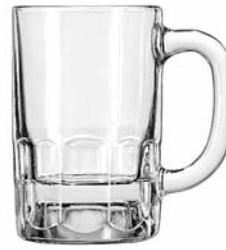
Handled Mug No. 5010 12 oz./35.5 cl./355 ml. H5½ T3¾ B3¾ D4½ 2 doz./41# • 1.27 cu.ft. SCC 334520 TRAEX TR-5AA □