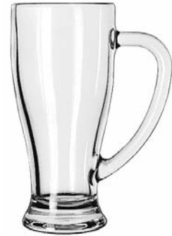
Cafe Mug No. 5286 14 oz./41.4 cl./414 ml. H6¼ T3½ B2½ D5 1 doz./17# • .86 cu.ft. SCC 592064 TRAEX TR-4DDA □