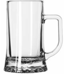
Maxim Mug No. 2329SA450 17½ oz./52.0 cl./520 ml. H6½ T3¼ B3½ D5½ 1 doz./26# • 1.17 cu.ft. SCC 368140 TRAEX TR-4DDD □