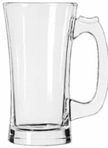
Mug No. 5203 11 oz./32.5 cl./325 ml. H5½ T3½ B2¾ D5¾ 2 doz./26# • 1.24 cu.ft. SCC 759590 TRAEX TR-8DD □