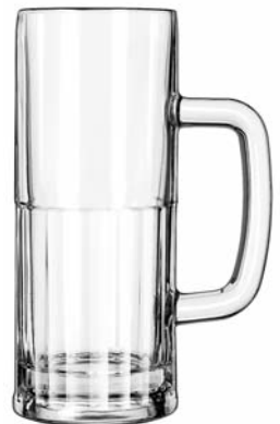
Mug No. 5360 22 oz./65.1 cl./651 ml. H8 T3½ B3¼ D5½ 1 doz./27# • 1.10 cu.ft. SCC 021168 TRAEX TR-4DDA □