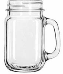
Drinking Jar No. 97084 16½ oz./48.8 cl./488 ml. H5¼ T2¾ B2½ D4½ 1 doz./12# • .63 cu.ft. SCC 871421 TRAEX TR-5AA □