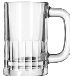
Mug No. 5364 12 oz./35.5 cl./355 ml. H5½ T3¼ B3¼ D5½ 1 doz./24# • .75 cu.ft. SCC 053725 TRAEX TR-4DD □