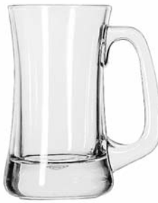
Scandinavia No. 5297 12 oz./35.5 cl./355 ml. H5½ T3½ B3¾ D4¾ 1 doz./20# • .77 cu.ft. SCC 031962 TRAEX TR-4DD □