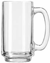
Handled Mug No. 5012 12½ oz./37.0 cl./370 ml. H5½ T2¾ B2¾ D4½ 2 doz./32# • 1.28 cu.ft. SCC 344536 TRAEX TR-5AA □