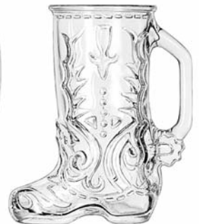
Boot Mug No. 97036 17 oz./50.0 cl./500 ml. H6½ T3¼ B3¾ D5½ 1 doz./17# • .98 cu.ft. SCC 032693 TRAEX TR-8DDA □