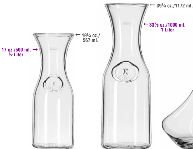
Wine Decanter No. 97001 19 1/4 oz./56.7 cl./567 ml. H8 3/8 T3 B3 1/2 D3 1/8 1 doz./13# = .72 cu.ft. SCC 604753 TRAEX TR-6BBB □