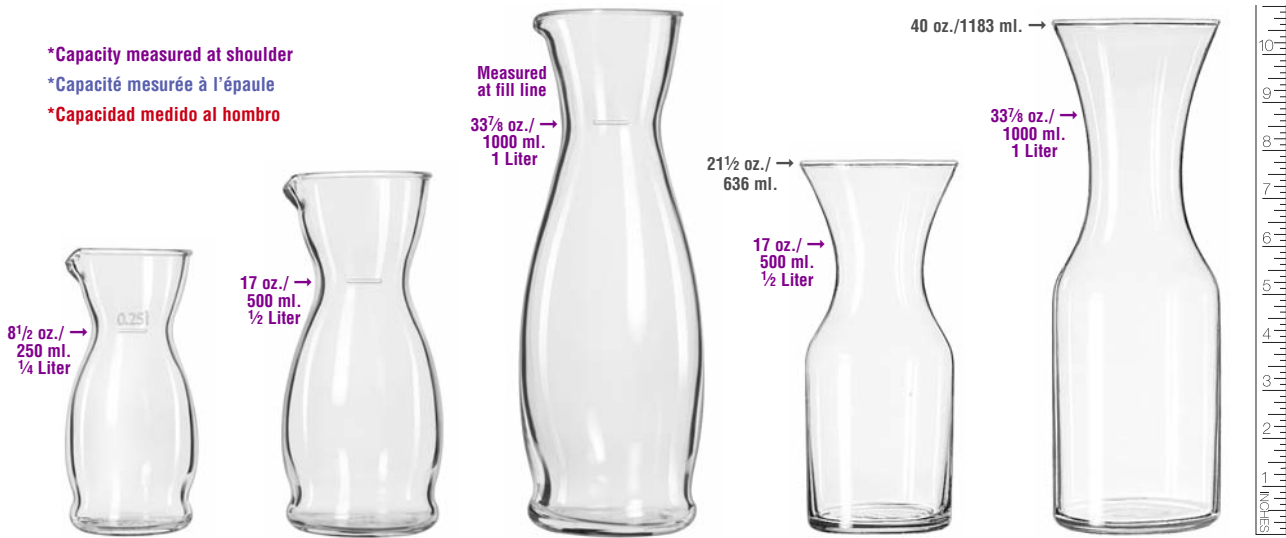
Carafe No. 13172621 H6 T2 3/4 B2 5/8 D2 7/8 1 doz./10# = .40 cu.ft. SCC 08002713097997 TRAEX TR-7CC □

*Capacity measured at shoulder *Capacité mesurée à l'épaule *Capacidad medido al hombro