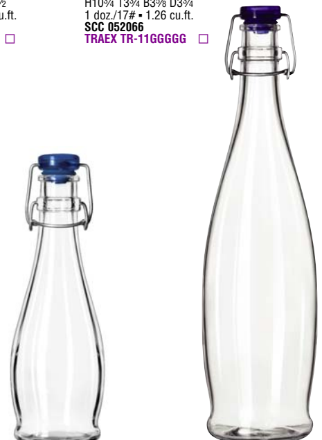
Water Bottle w/Wire Bail Lid No. 13151017 12 oz./35.5 cl./355 ml. H8 1/8 T1 1/4 B2 3/8 D2 1/2 1 doz./10# = .56 cu.ft. SCC 08002713088308 TRAEX TR-2HHHH □