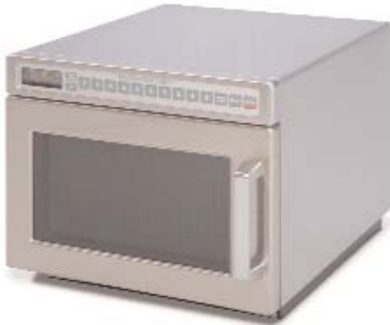
Model MDC12A2 shown