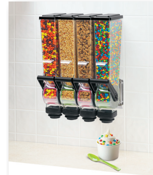
SLIMLINE™ DISPENSERS Model DFD